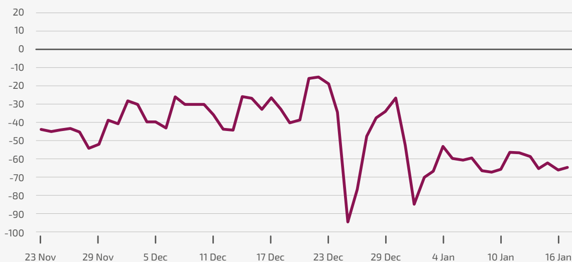
North East LEP area: Retail and recreation visit index (compared early 2020)